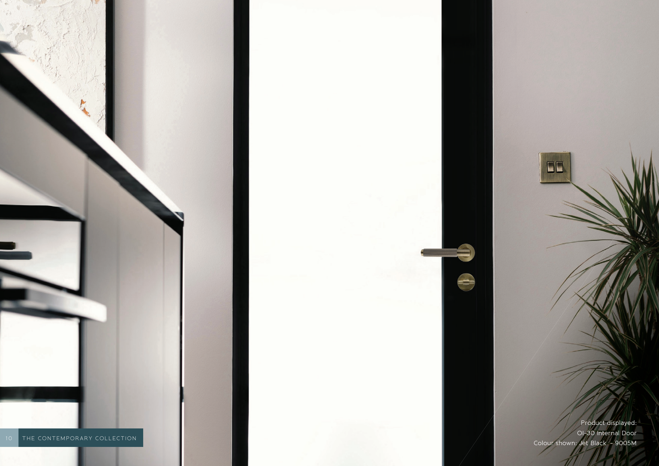
Product displayed: OI-30 Internal Door Colour shown: Jet Black - 9005M